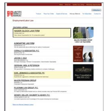
Specific Practice Area Page 3 priority ads allowed on the page - $1,000 per ad

Web Ads are sold on a First-Come, First-Served basis.