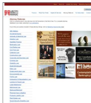
State Attorney Search Page 9 ads allowed on the page - $1,000 per ad