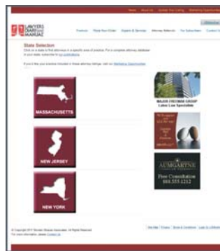
Attorney Search Home Page 3 ads allowed on the page - $750 per ad

MAXIMIZE your exposure and STAND OUT from your competitors with a Display Ad! ->